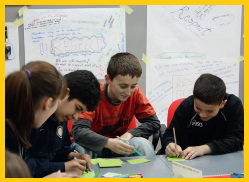
LOJA's prevailing motto – "Respect" towards all other ethnic groups