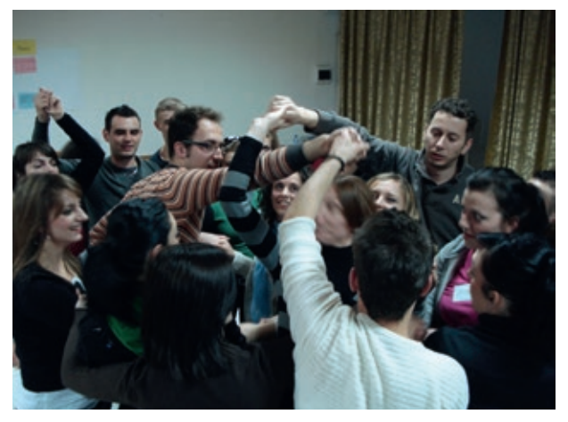
Team-building games play a very important part in the trainings of LOJA

As described above, LOJA had already developed a number of strategies to engage ethnically mixed groups in spare-time activities. KURVE could supplement these programmes with trainings in peaceful conflict transformation and mediation, mainly directed at the so-called multipliers. These courses focused, amongst other things, on team-building through proven interactive methods which at that time were fairly new to the NGOs in Macedonia.