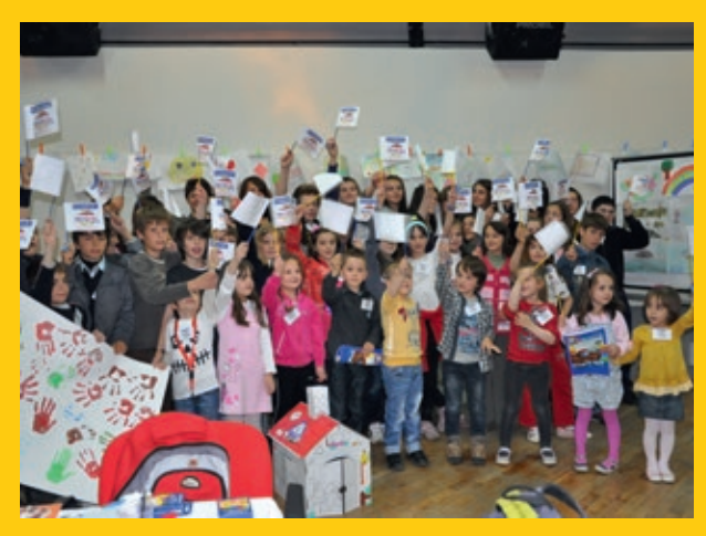
Working with children of pre-primary age is of utmost importance for future inter-ethnic understanding