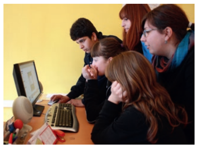
Shared pastime activities form a bridge between different ethnic groups

With projects like making a film or a wall newspaper with the help of up-to-date computer technology, it was quite easy to draw in youths from very different backgrounds. To safeguard the right ethnic balance, LOJA built up contacts with various local schools which recommended their students to take part in these extra-curricular activities.