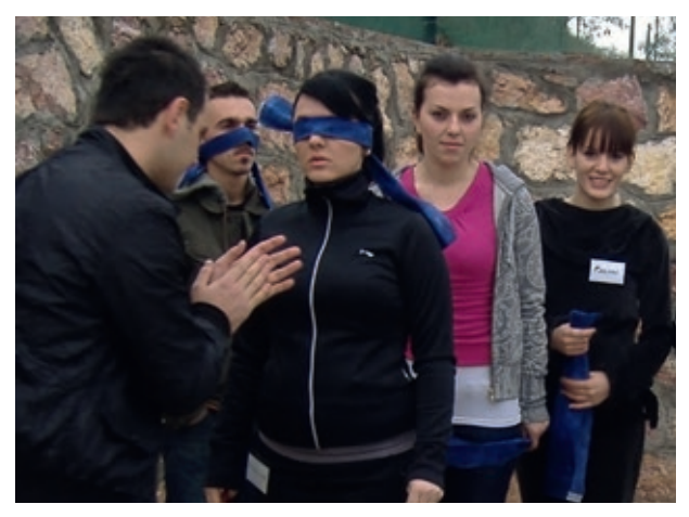
Trusting the "other side" means accepting some guidance even when being blind-folded

tions. Who is "key" usually depends upon the context of a conflict situation, sometimes these key people can't even be defined as clearly different from the "ordinary" people. LOJA targeted virtually everybody who could have an influence on young people, referred to as the "multipliers in youth work". Key people could include official as well as unofficial youth group leaders, but also those who might be most likely to perpetrate violence. Likewise, parents were involved – as well as teachers who, as stated above, provided the link to the socio-political level.